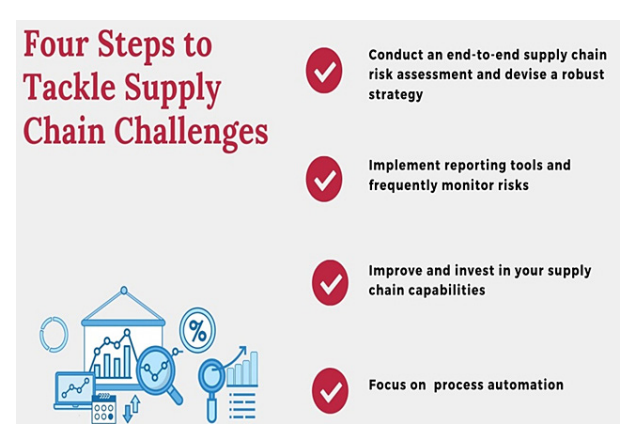
Fig.1: Supply chain strategies and challenges

The government is committed to continuing to work very hard as a form of seriousness in handling Covid-19. This commitment is formulated through the making of public policy (strong public health policy response) related to the handling of the outbreak in the form of drug and medical device supply chain management.